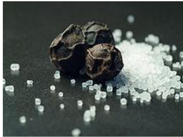
Pepper compared to Salt