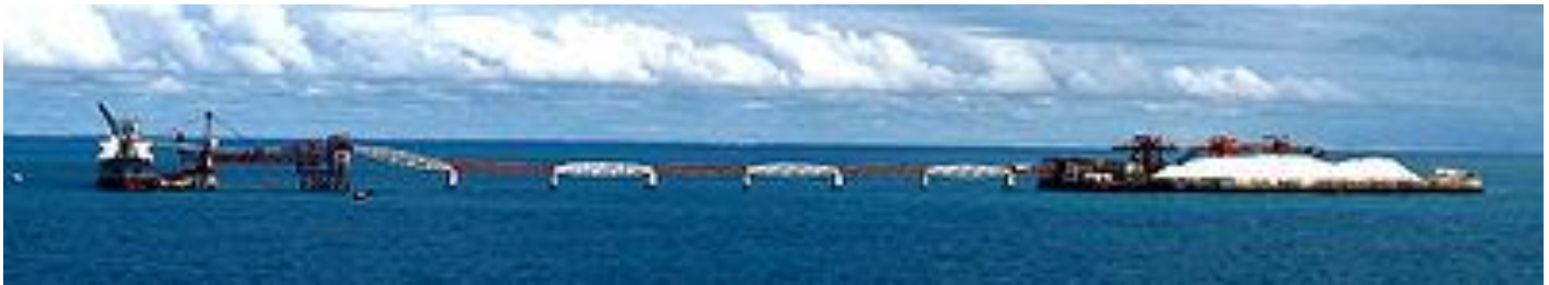
Salt being loaded onto a Barge