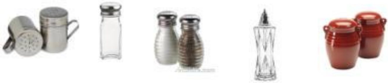
Various styles of salt shakers