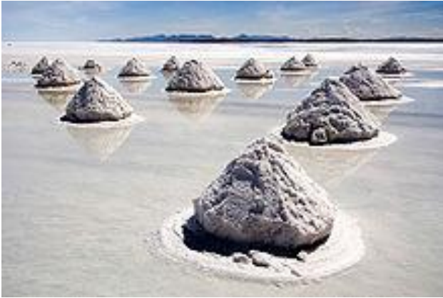
Bolivian piles of salt